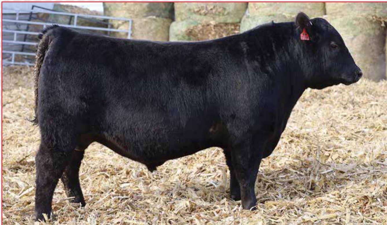
SVA BENCHMARK 4004 – He sells as Lot 4