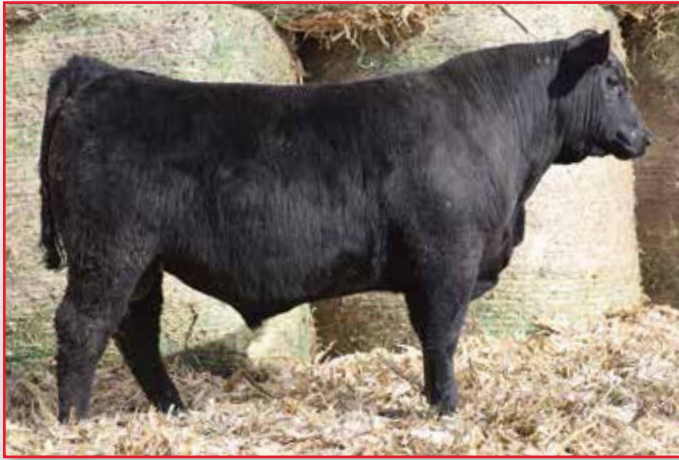
SVA WHITE WATER 4506 – He sells as Lot 14