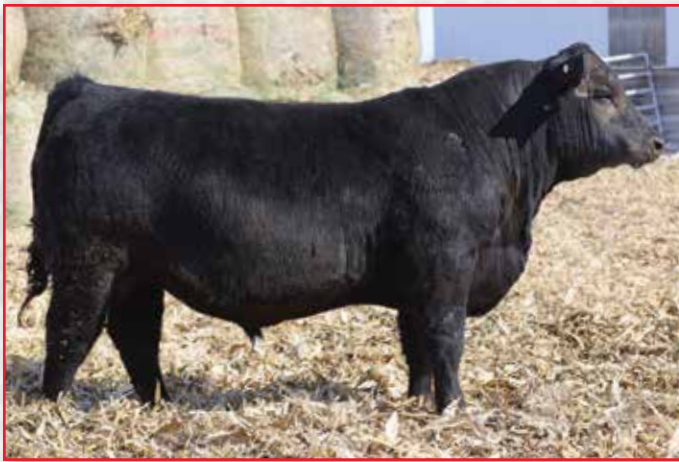
SVA MAN IN BLACK 174 – He sells as Lot 32