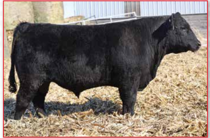
SVA COMMADORE 187 – He sells as Lot 36