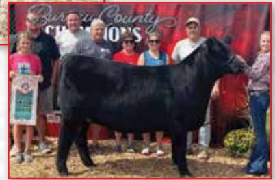
CK3 PHYLISS J122 – Dam of Lot 54.