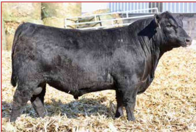
SVA EMPIRE 181 – He sells as Lot 33