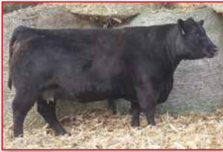
SVA PATRICIA 0001 – Maternal sister to Lot 2.