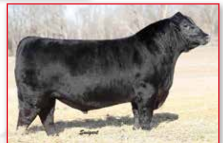
LINZ EXEMPLIFY 71124 – His sons sell.