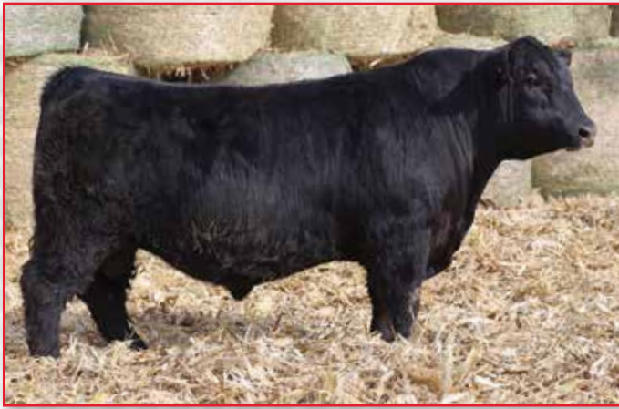
SVA REGIMENT 4007 – He sells as Lot 10