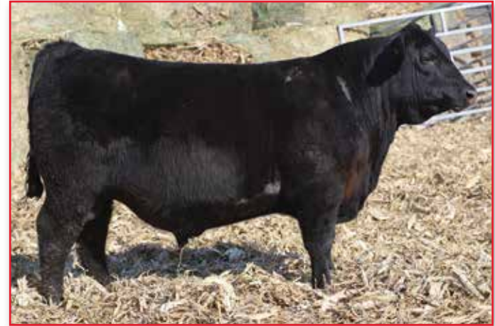
SVA TANK 4042 – Sells as Lot 18