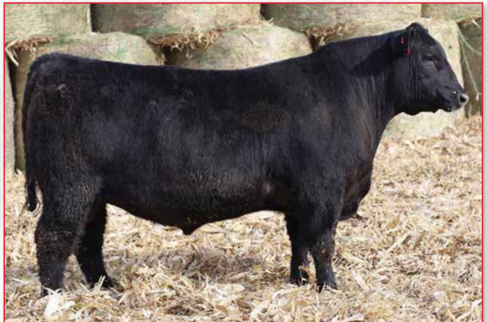
SVA CRAFTSMAN 4008 – He sells as Lot 3