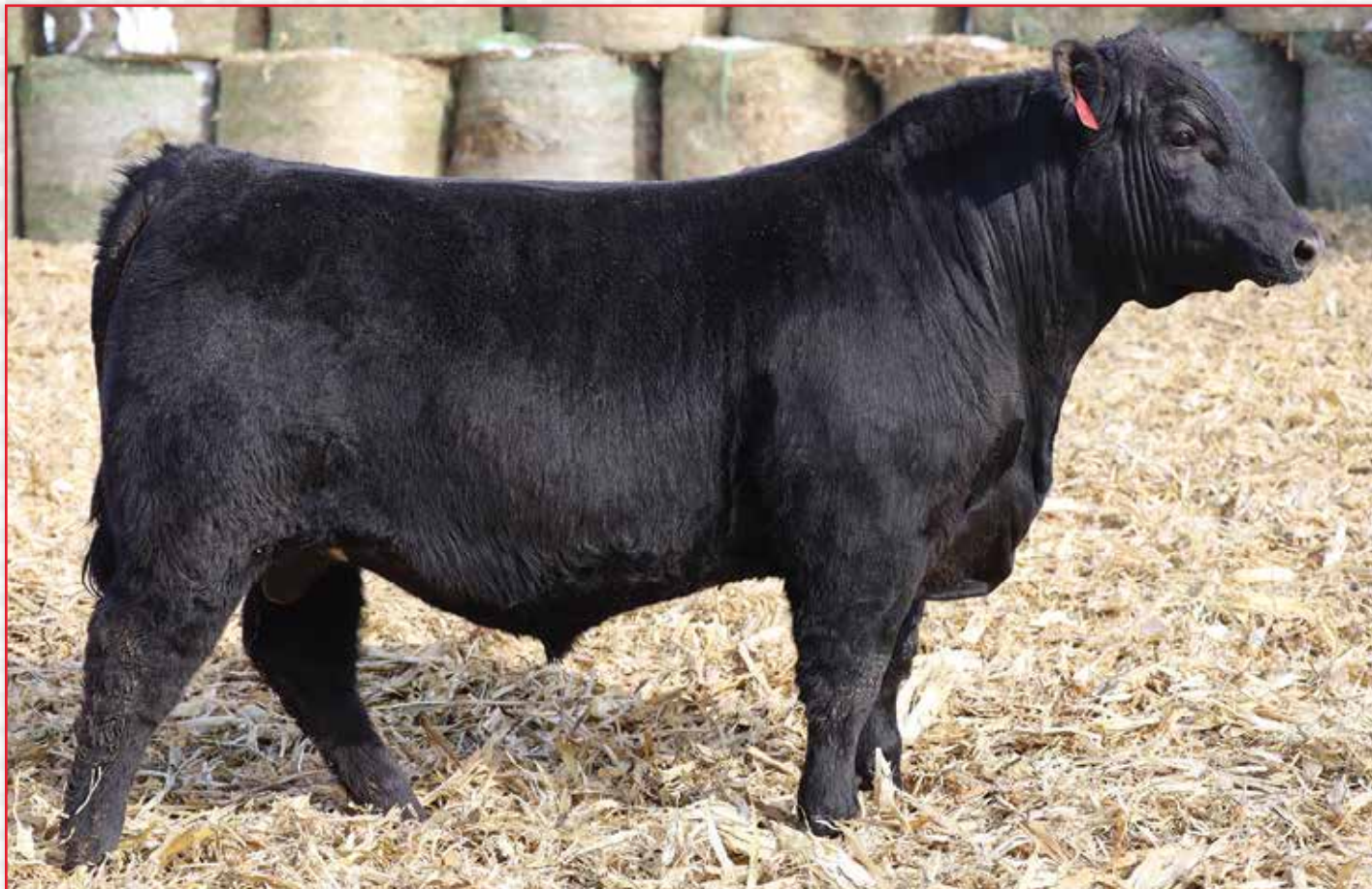
SVA CRAFTSMAN 4027 – He sells as Lot 1