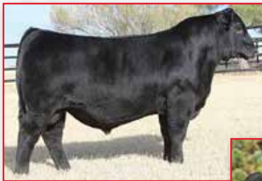
WILKS REGIMENT 9035 – His sons sell.