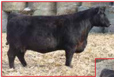
SVA PATRICIA 2023 – She sells as Lot 49