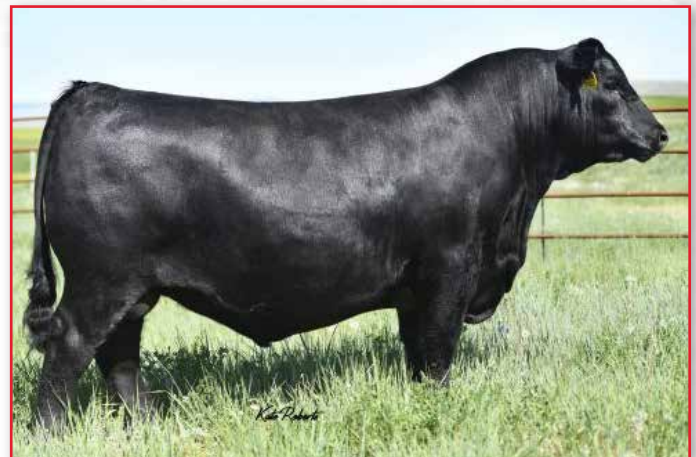
LAR MAN IN BLACK – Sire of Lot 32