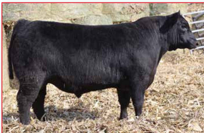
THF 220 RESOURCE L18 2318 - He sells as Lot 24