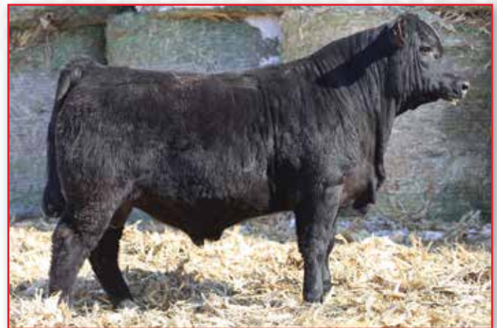
SVA TANK 4040 – He sells as Lot 17