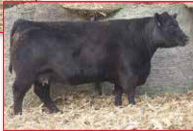
SVA PATRICIA 0001 – She sells as Lot 52