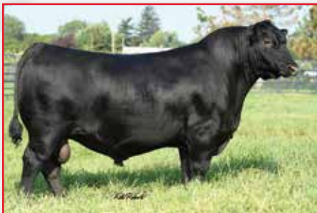
CONNEALY CRAFTSMAN – Sire of Lots 1, 2 and 3.