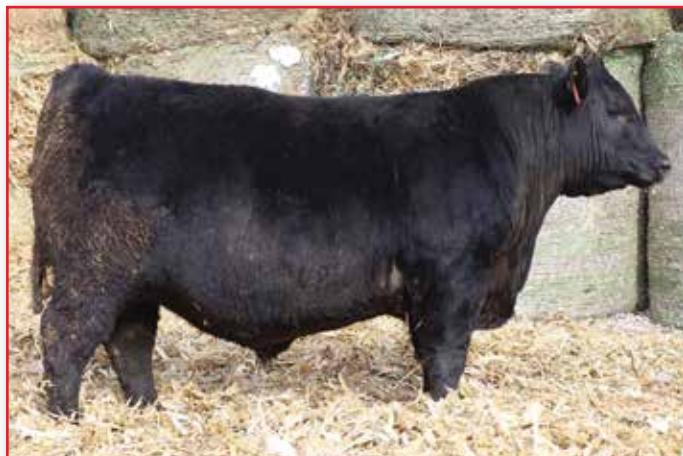
SVA BENCHMARK 4028 – He sells as Lot 5