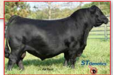
CONNEALY COMMERCE – His sons sell.