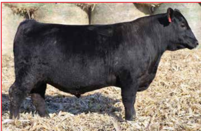
SVA REGIMENT 4030 – He sells as Lot 11