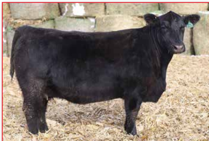
SVA MISS BLACKBIRD 3019 – She sells as Lot 44

• This two-year-old female by the $280,000 HCC Whitewater 9010 is from a dam bred in the Bush herd. • The grandam and third dam are both Pathfinder Dams. • Will sell with a calf at side (Lot 44A) by SVA MAN IN BLACK 120.