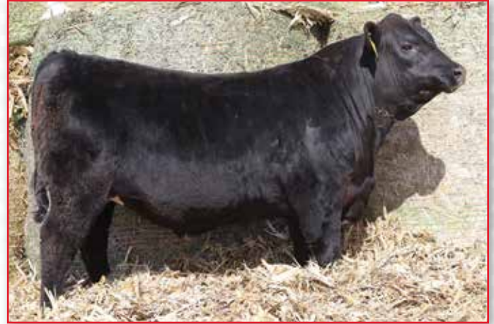
SVA 220 RESOURCE 242 – He sells as Lot 25