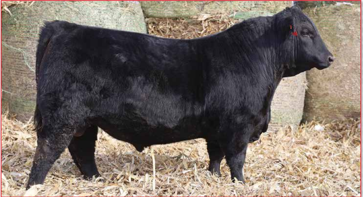
SVA EXEMPLIFY 4005 – He sells as Lot 7