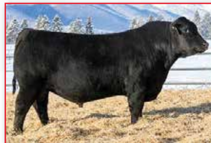
MILL BRAE BENCHMARK 9016 – His sons sell.