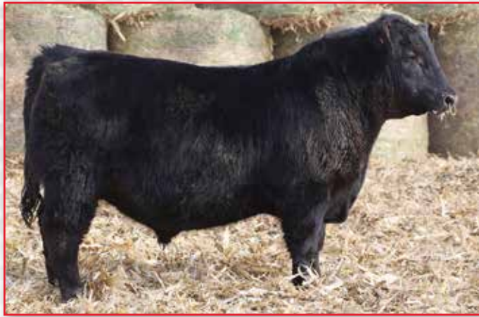
SVA LINCOLN 4044 - He sells as Lot 19