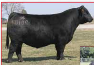
HCC WHITEWATER 9010 – His progeny sell.