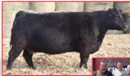
SVA FOREVER LADY 0017 – She sells as Lot 53