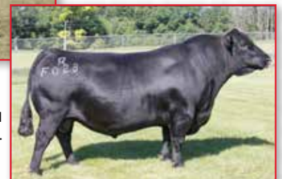
TEHAMA PATRIARCH F028 – His progeny sell.