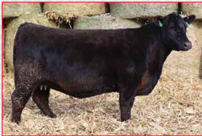
SVA GOLDEN ROSE 3014 – She sells as Lot 43