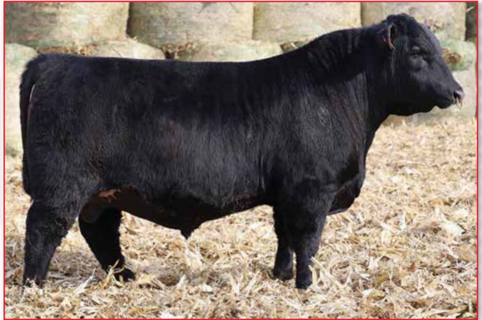
SVA CRAFTSMAN 4012 – He sells as Lot 2