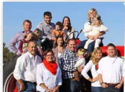
PYSZKA AND SONS CATTLE OPERATION FAMILY